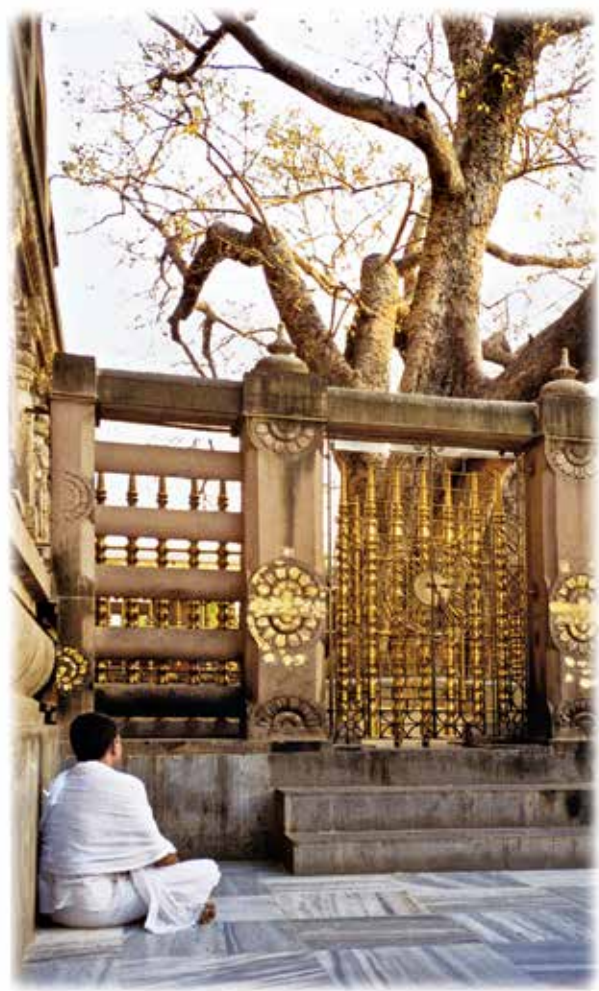
Bodhi Gaya, 1995