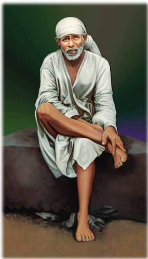
Sri Sai Baba of Shirdi